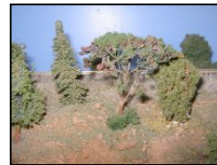
8 - Drill a hole, place some white glue on the tree or in the hole. Place several as you require.