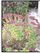
1 - This is the Plant in our garden

Sedum is a Plant which when dried can make some great trees.