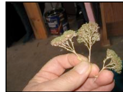
7 - Break off the size of tree you wish to plant. This is easier done after everything is dried or you may end up with some sprinkles glued to you.