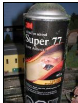
3 -This is the type of Contact Cement spray that I used. There are many on the market so to each their own.