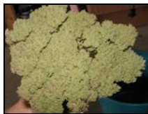
5 - Once the plant head is completely covered Let it dry overnight.