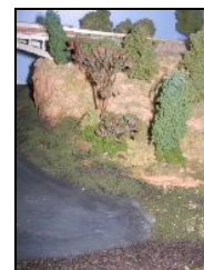
9 - My Brother-in-Law uses Sedum Trees for his garden Railroad using the whole plant head. These have been done the same way but with a coat of clear lacquer on top to handle the rain. Racoons have a tendency to eat them if you plan on doing a Garden Railroad.