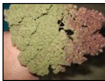
4 - Spray the contact cement liberally on the plant head. Sprinkle the colour that you wish to make the tree. Gene's Tennessee module had some Sedum Trees done In Orange and Red.