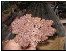
2 - This is the plant in its dried state. It has been drying for a year